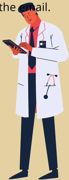
Image of spravka must have good resolution so we can read stamps and the following detail that should be stated in the email.

city, name of the clinic, contacts, name of the doctor and his/her contacts, your contact, ID and IIN.